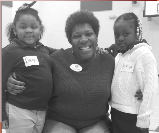
...because all blood is red

He said, “Don’t get me wrong. I’m really proud of you. I know that in this place they use to call us slaves. In this place, they called us 3/5 of a man. In the same place, they call us chattel. So, I’m really proud that they now gonna call you a congressman. But the thing that made me cry, was that, realizing I was deprived of an education, I now realize what I could have been.”