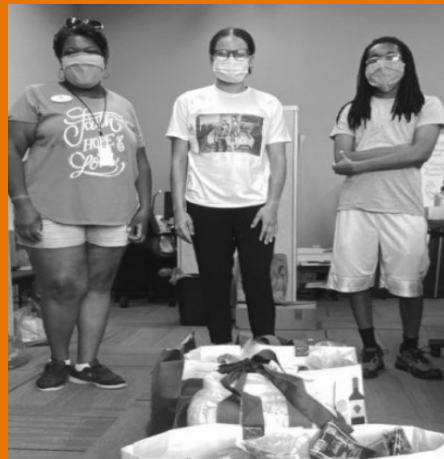
Stl Mutual Aid North County Pod

Launching this year is an opportunity for North County youth to engage in reshaping our food system!