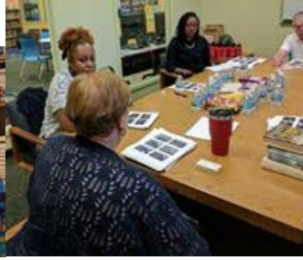
Credit & Nutrition