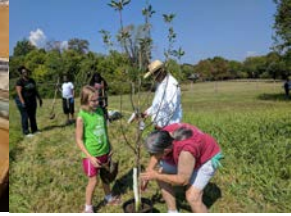
Planted Apple Trees

A Red Circle is officially part of NoCo Rocks in Florissant!