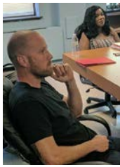
St. Vincent Home for Children